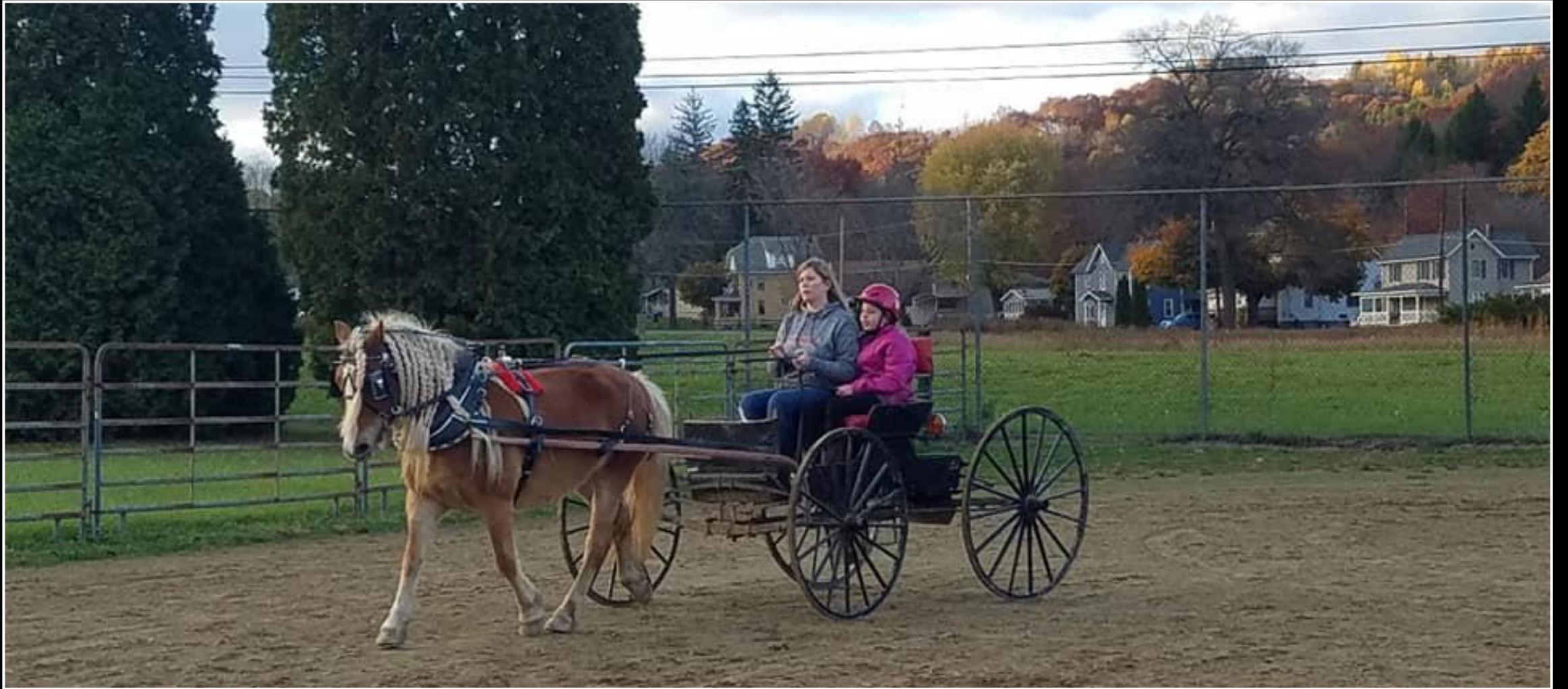
Youth participant and parent driving lesson