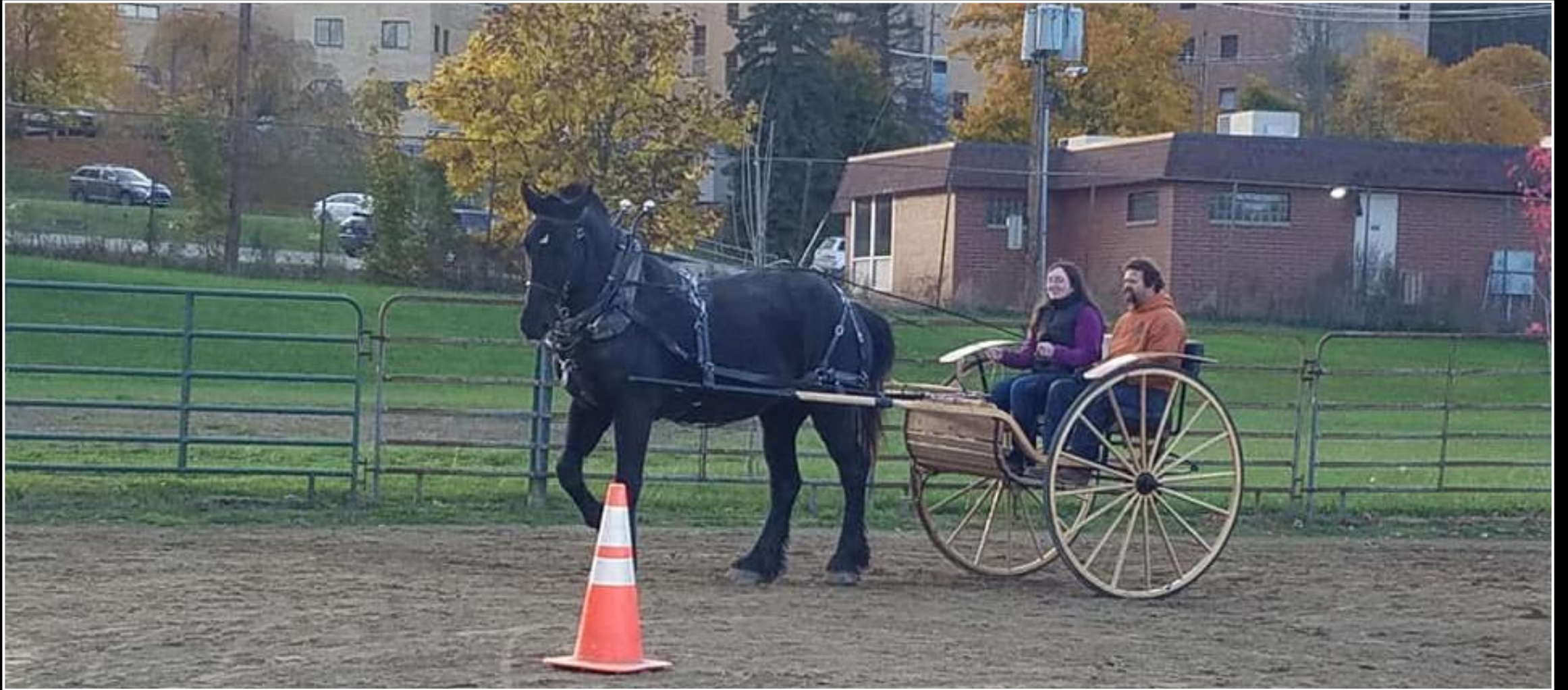
Obstacle course driving lesson