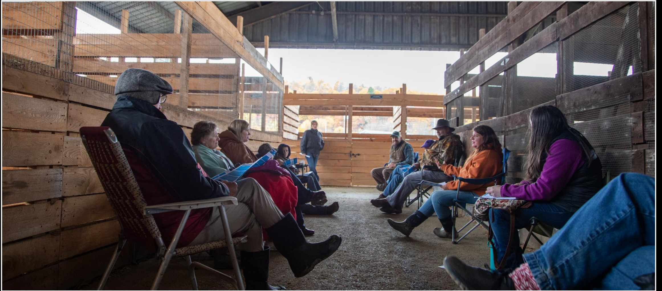
Body condition scoring and nutrition discussion