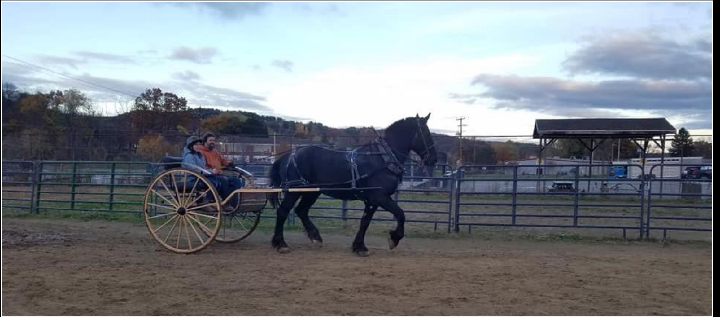
Youth draft cart driving lesson