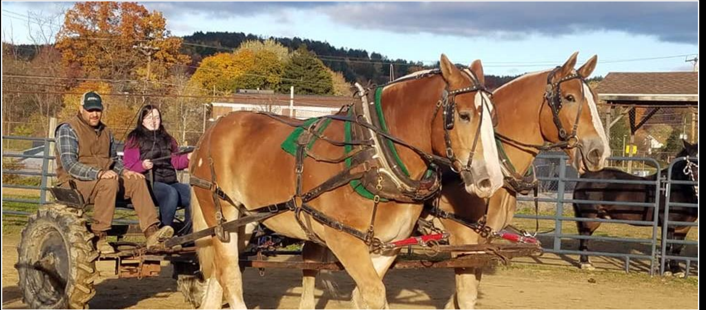
Driving the working team lesson