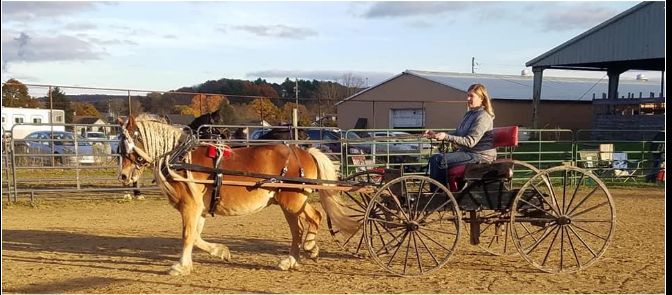
Adult participant 4-wheeled vehicle driving lesson