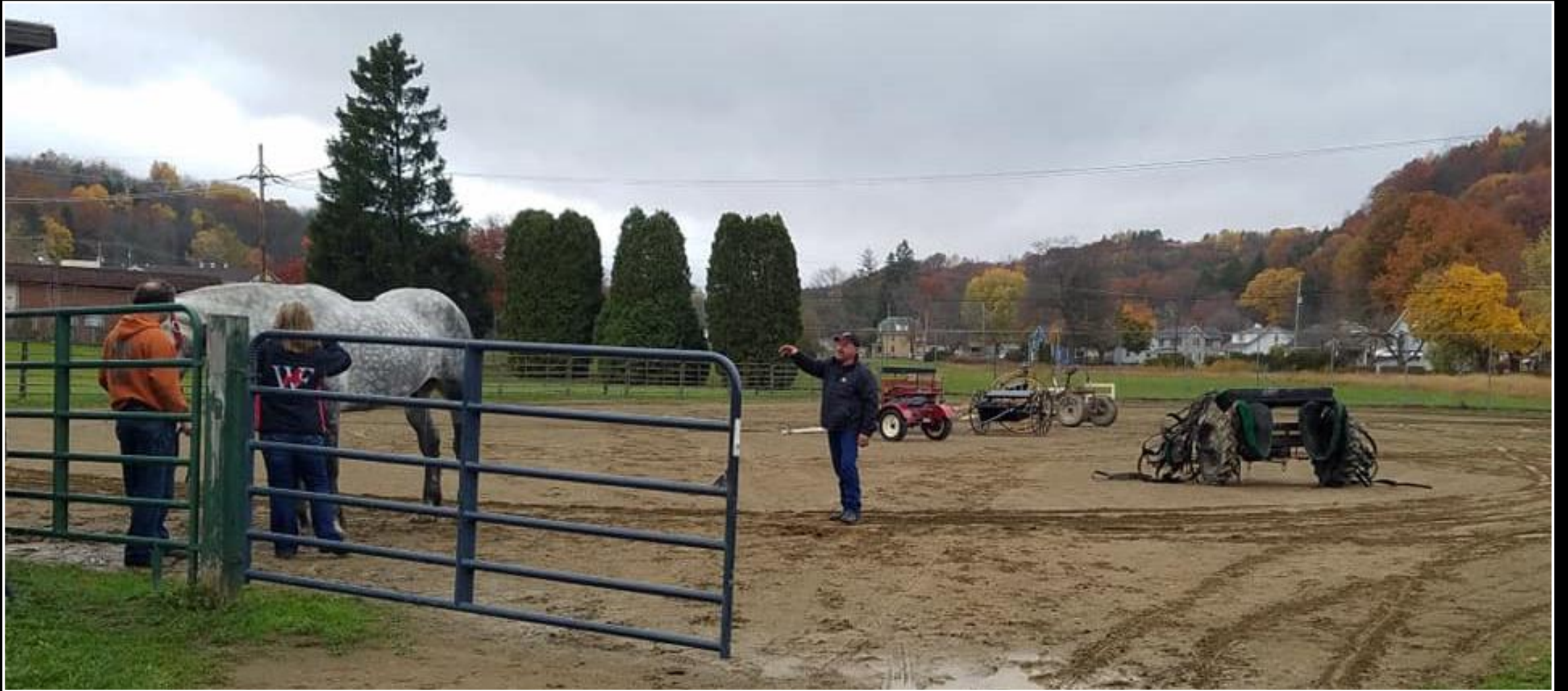
Conformation discussion and measuring the draft horse