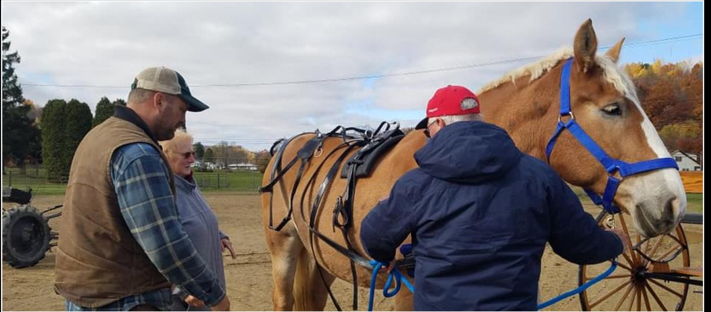
Participant horse harness fitting