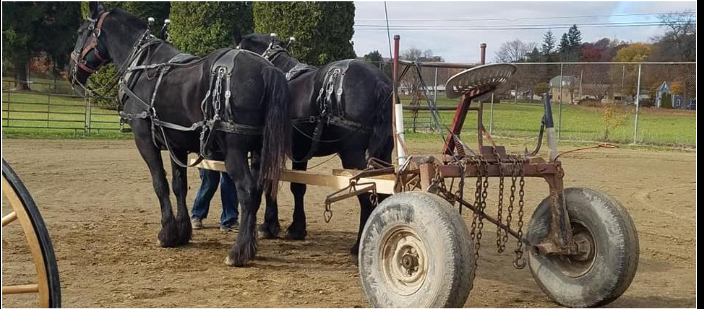
Working team hitching demonstration