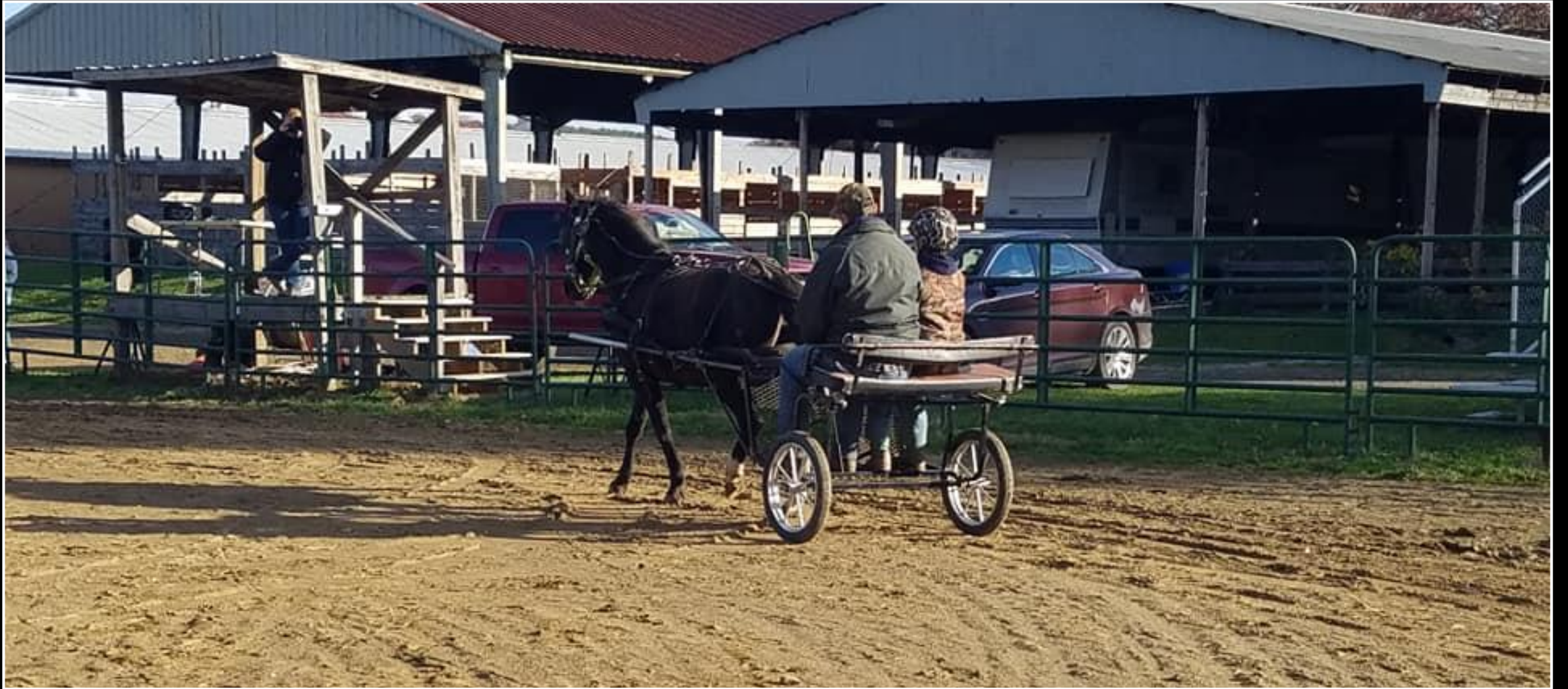
Youth and parent driving lesson