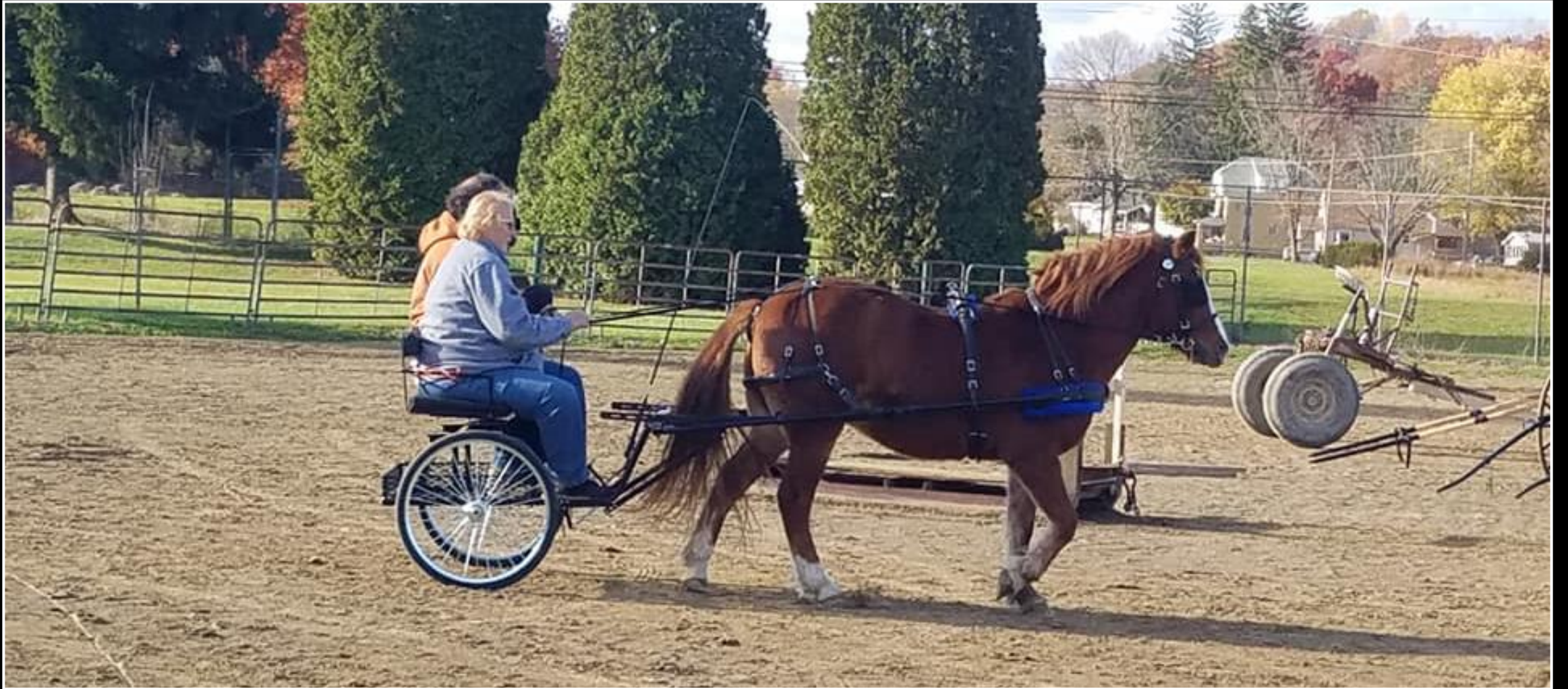
Adult driving lesson