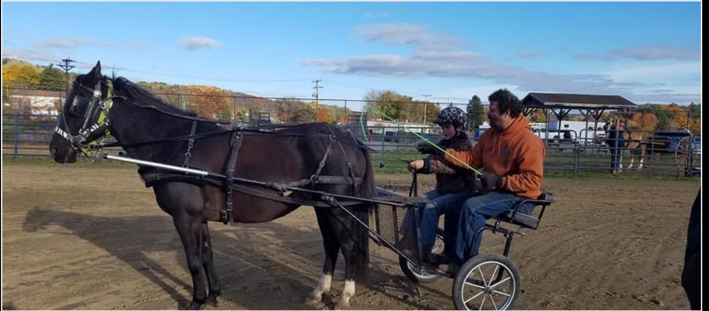
Youth driving lesson