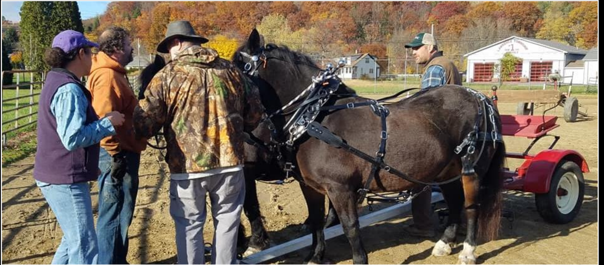
Hitching a participant's team of Percheron x Welsh ponies