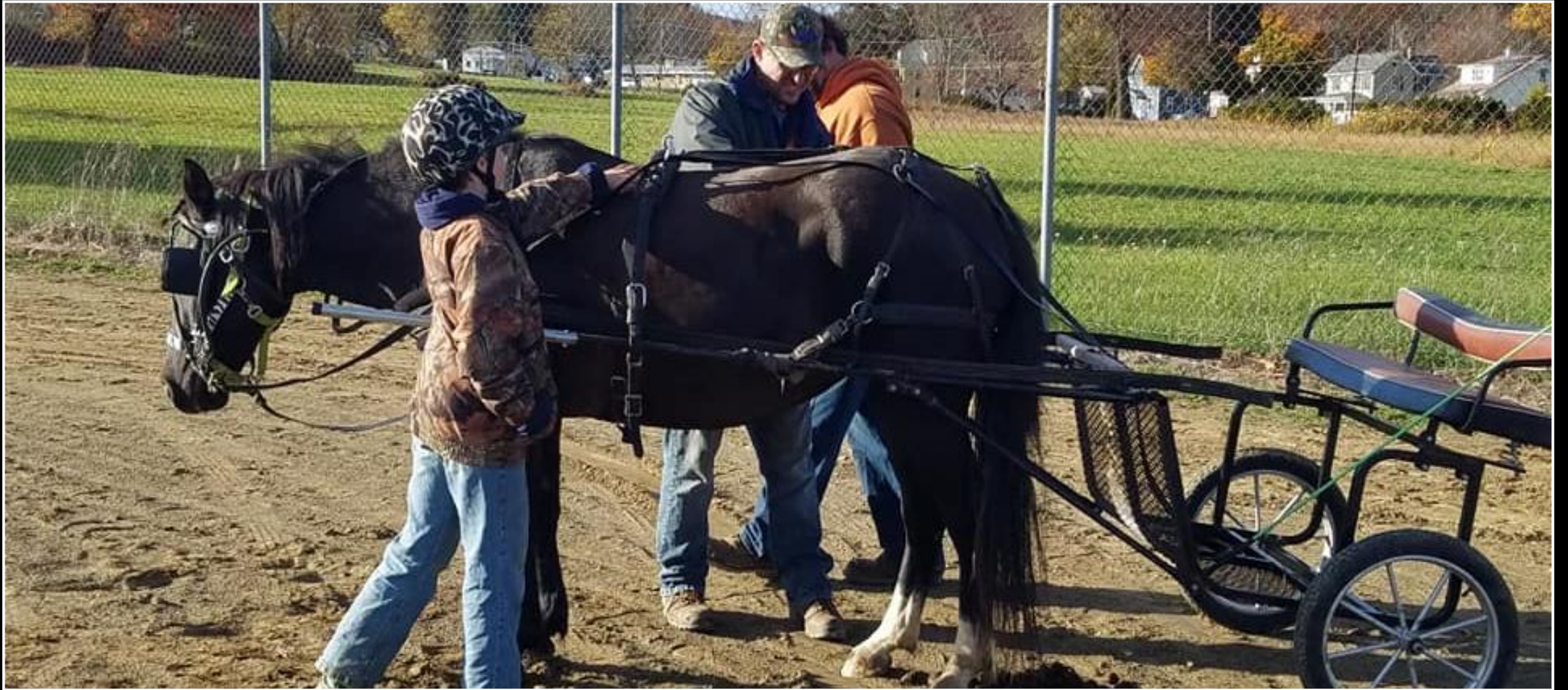
Youth harness and cart fitting