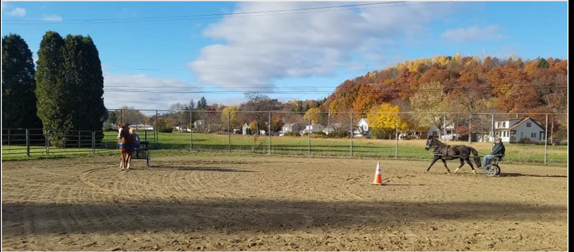
Mock driving class