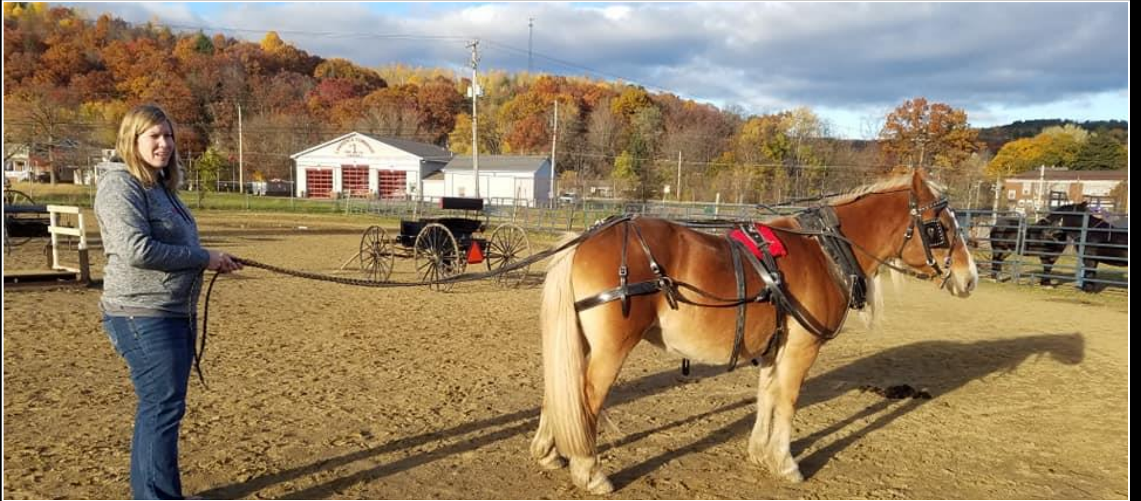
Ground driving lesson