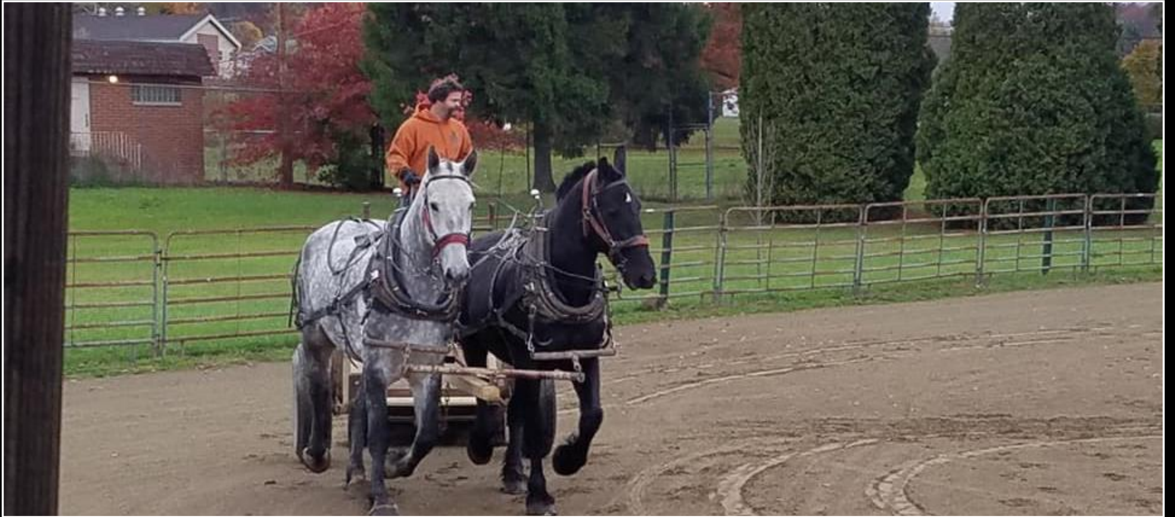
Logging/working team driving demonstration