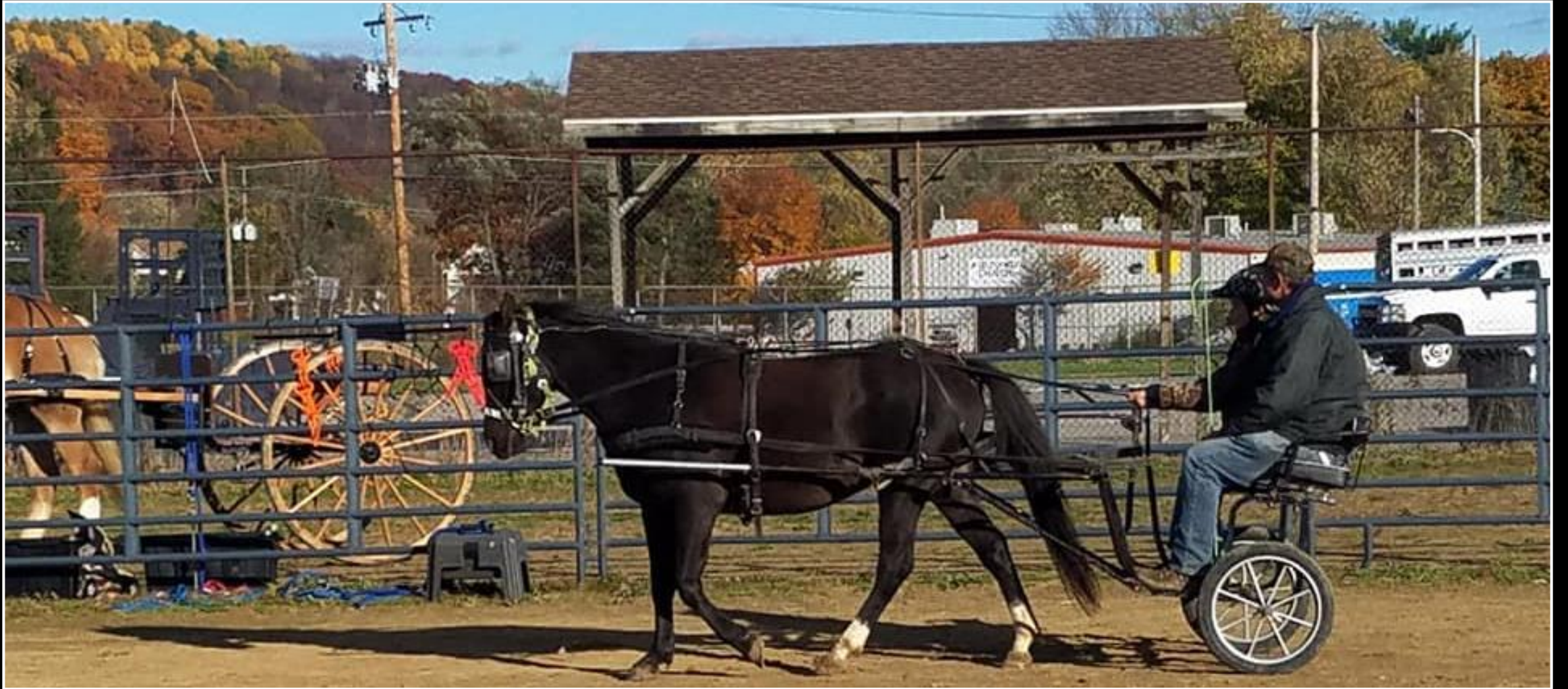
Youth driving lesson