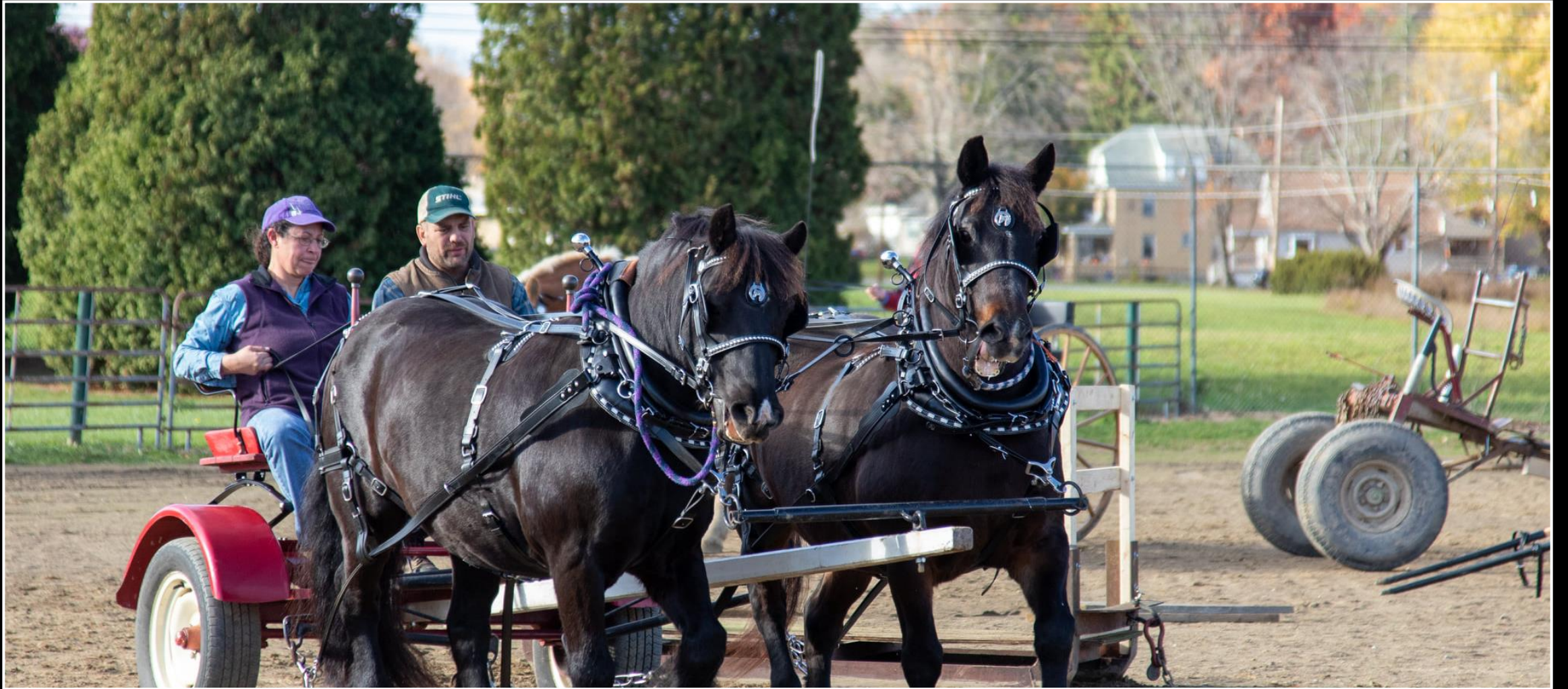
Participant team driving lesson